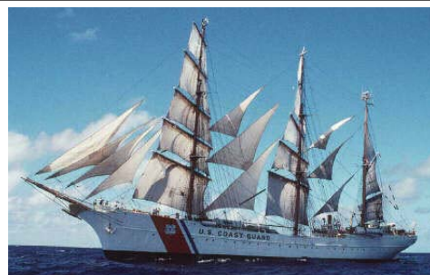
"America's Tall Ship" USCG Barque Eagle